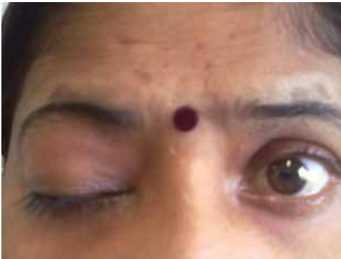
Presentation 5 days after IV antibiotics