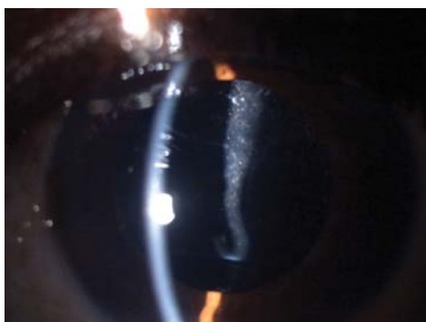
Figure 2: The capsule had rolled up from below