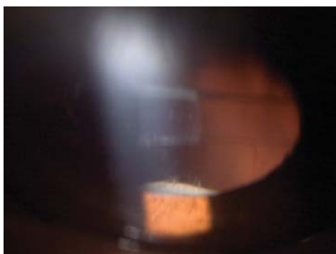
Figure 3: The dislocated hypermature nucleus